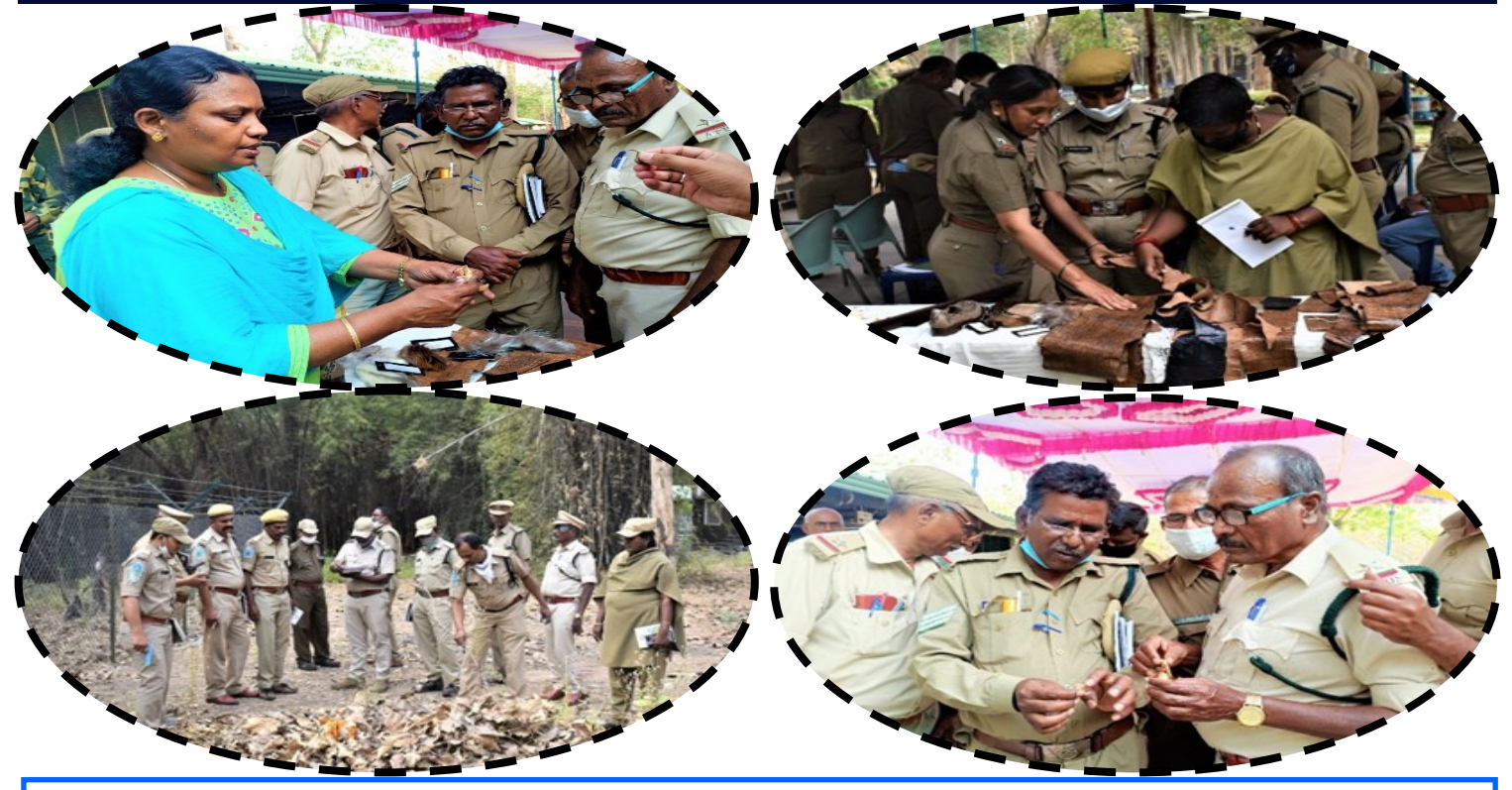
A two-days Capacity-building programme for officials of Nagarjunasagar Srisailam Tiger Reserve (NSTR), was conducted by Wildlife Crime Control Bureau (WCCB), on 24th & 25th March, 2021.