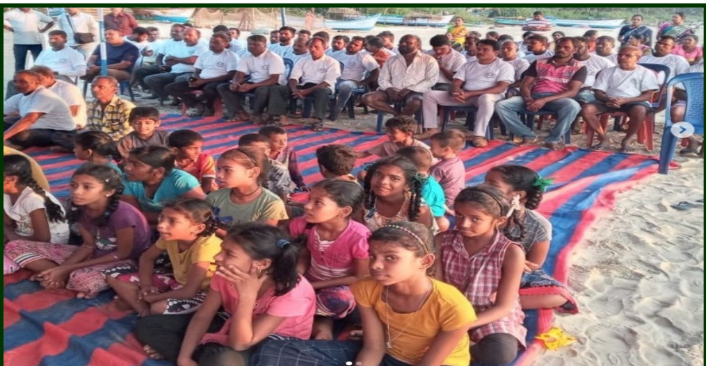
Fishermen Community living at Majali & Devbag villages of Karwar Karnataka, were sensitized about Illegal Wildlife Trade activities by WCCB officials.